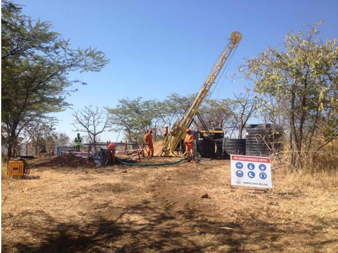
Figure 3: The Panda Hill 2014 drill program